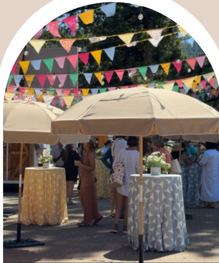
Outdoor Umbrellas 8 available $20 each