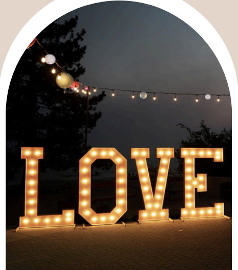
6 ft LOVE Letters $400