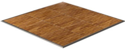
Outdoor Dancefloor 18 x 18 $750