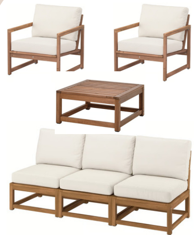
Outdoor Seating Sets 2 available $250 each