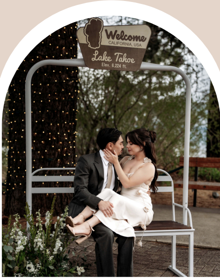
Ski Lift Chair with Tahoe Sign $400