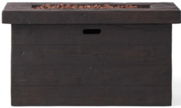
Outdoor Gas Firepit 2 available $150 each